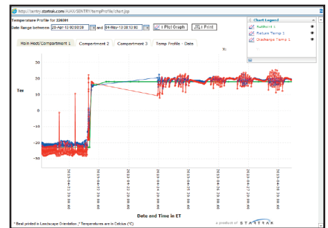
ReeferTrak® Temperature Profile

This solution allows for immediate fleet visibility of every type of reefer operation, including reefer temperature monitoring, modes of operation, fuel management, trailer delivery, logistics and dwell time, engine hours and usage, and human interaction for each trailer. By using the intelligent management of reefer-specific data, exceptions are quickly identified and remote commands solve problems in minutes without the need for field intervention.